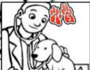
HAVING NO MONEY FOR THE VET AND HAVING TO KILL YOUR BEST FRIEND A.K.A. YOUR DOG